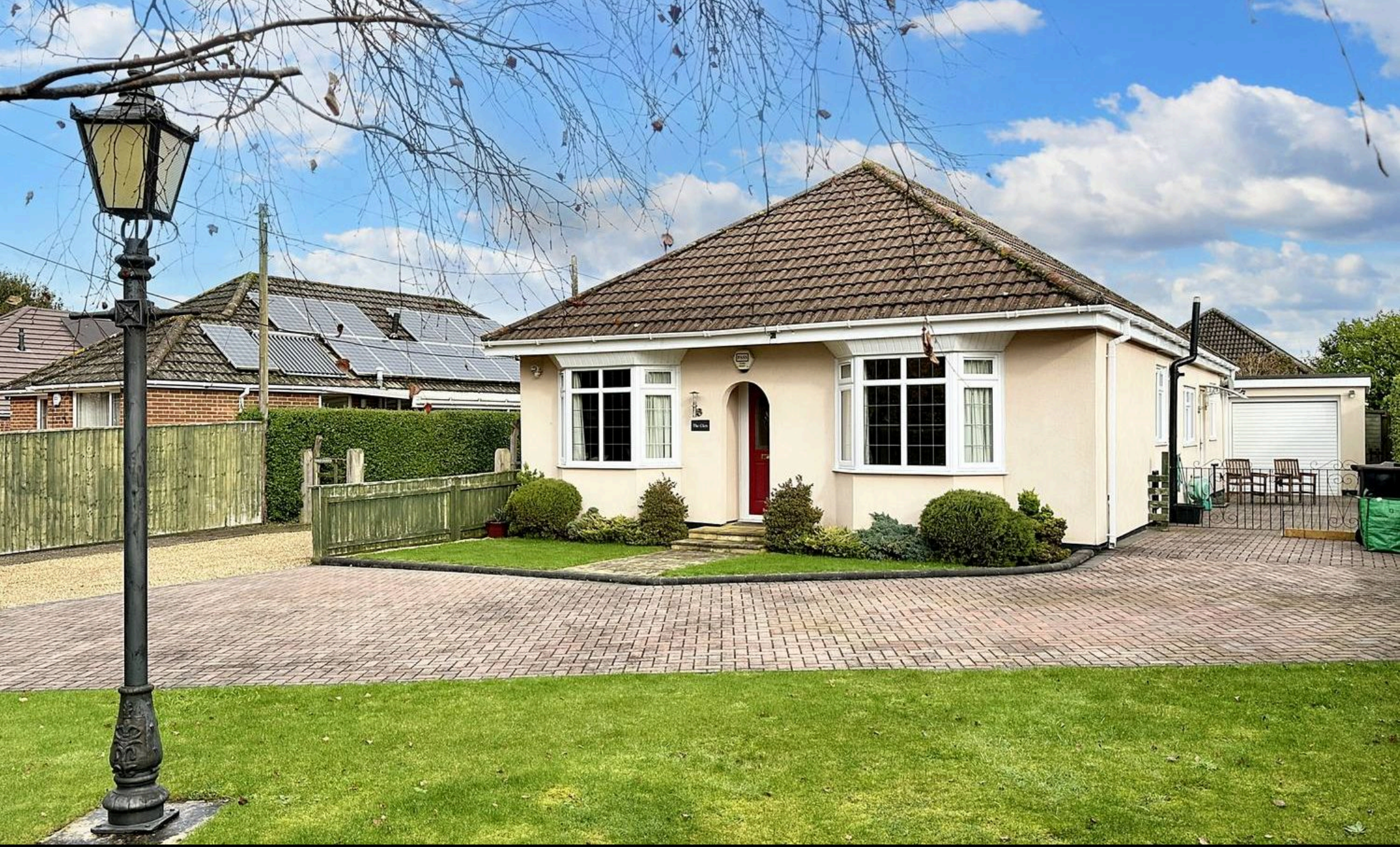
The Glen Chapel Lane, Langley £499,500