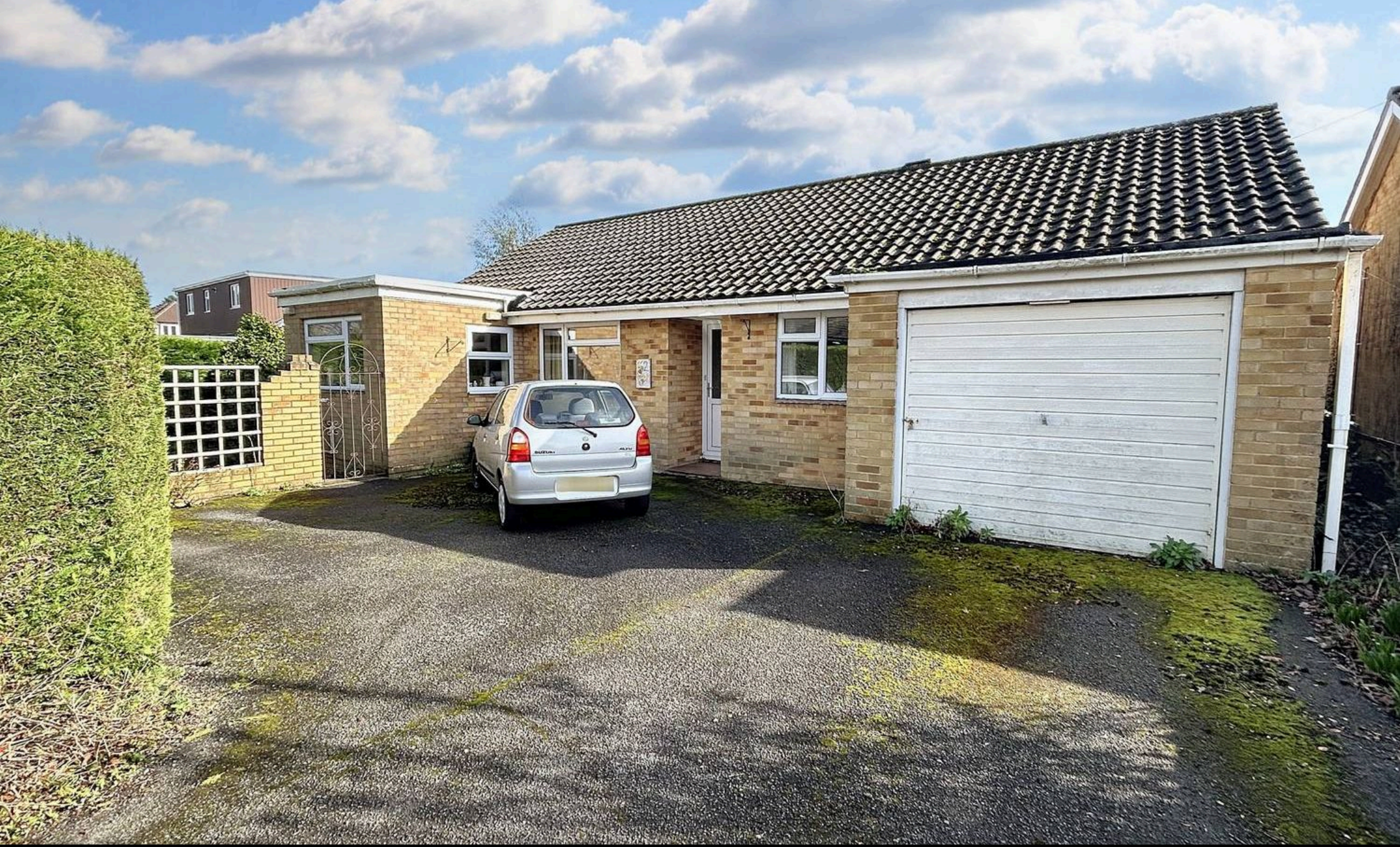
2 Hartsgrove Close, Blackfield £335,000