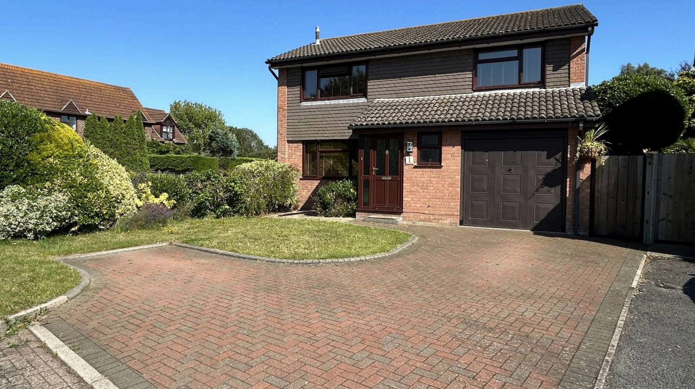
1 Foxy Paddock, Langley £399,950