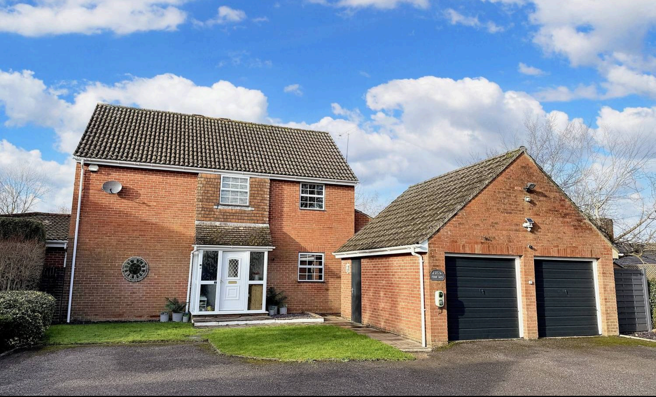
Four Jays Main Road, Marchwood £675,000