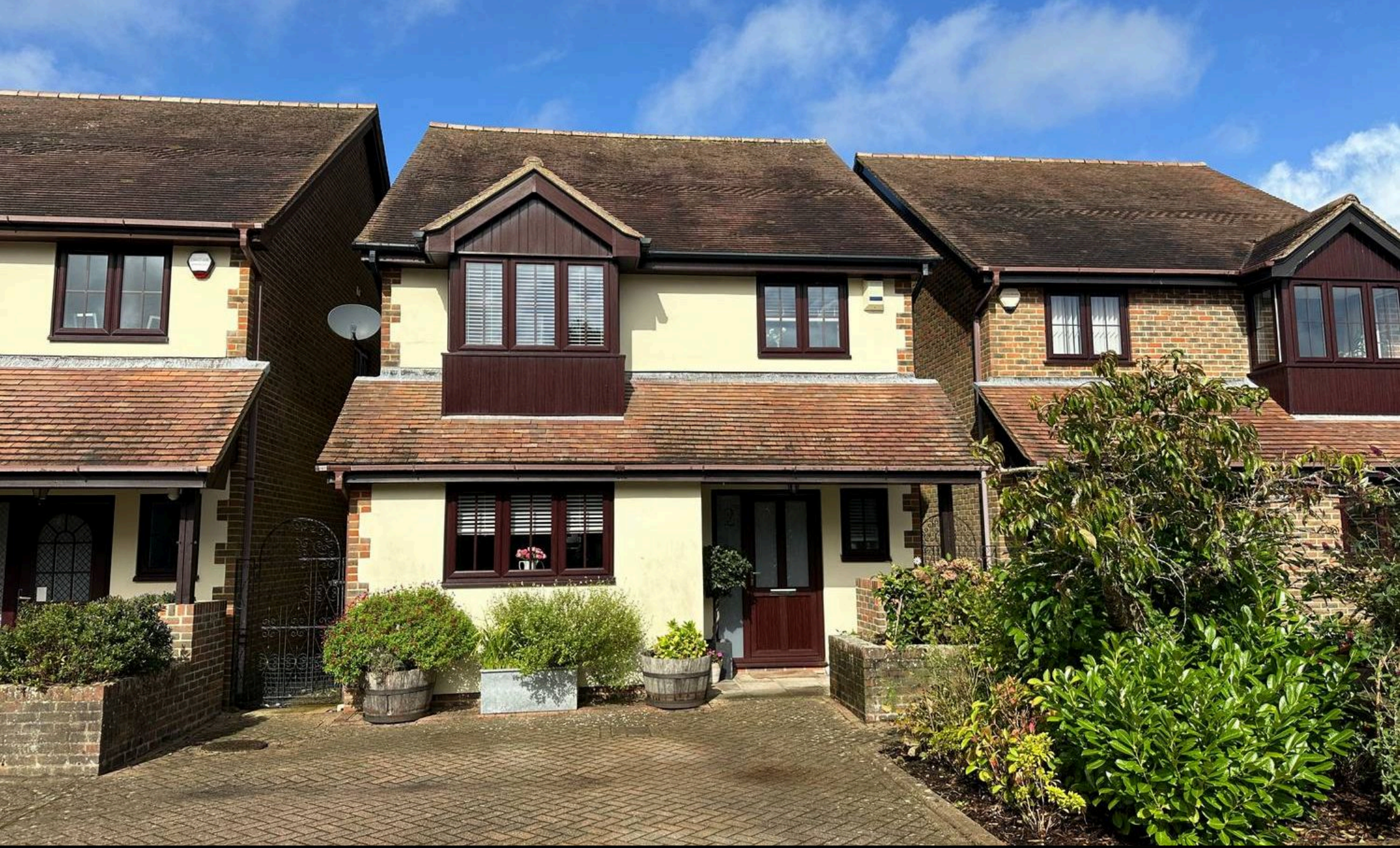
2 Barclay Mews, Hythe £469,950