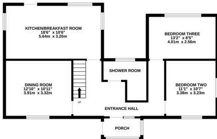
GROUND FLOOR 772 sq.ft. (71.7 sq.m.) approx.