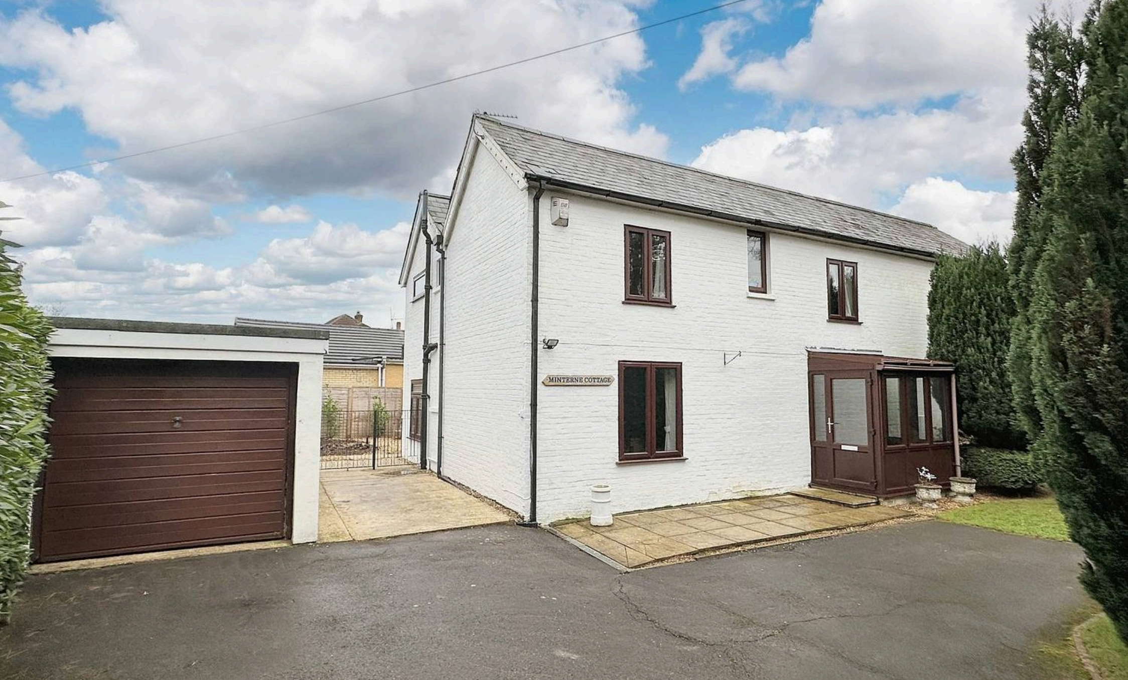
Minterne Cottage Roman Road, Dibden Purlieu £560,000