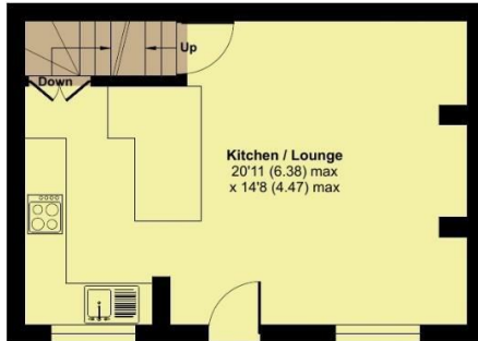
GROUND FLOOR APPROX FLOOR AREA 29 SQ M (313 SQ FT)