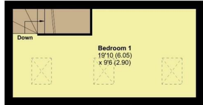
SECOND FLOOR APPROX FLOOR AREA 17.3 SQ M (187 SQ FT)