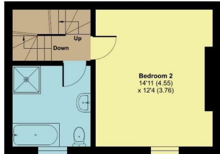
FIRST FLOOR APPROX FLOOR AREA 29 SQ M (313 SQ FT)