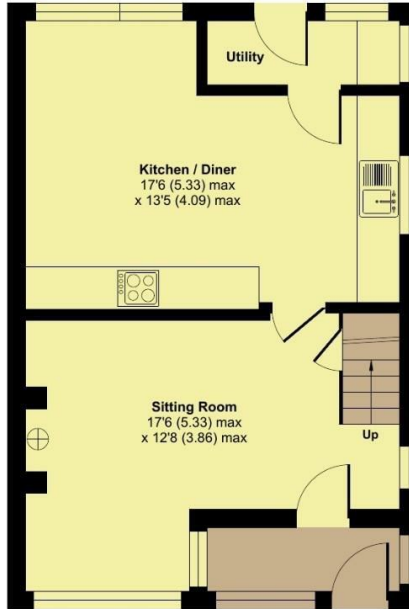
GROUND FLOOR APPROX FLOOR AREA 43.6 SQ M (470 SQ FT)