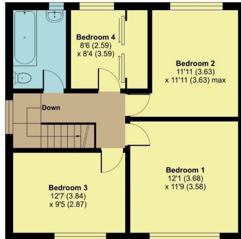
FIRST FLOOR APPROX FLOOR AREA 59.1 SQ M (637 SQ FT)