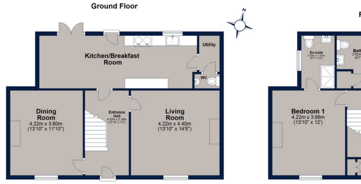
Bedroom 1 4,22m x 3.66m (13'10" x 12') Bedroom 4 3.20m x 1.81m (10'0' x 5'11') Bedroom 4 3.20m x 1.81m (10'0' x 5'11')