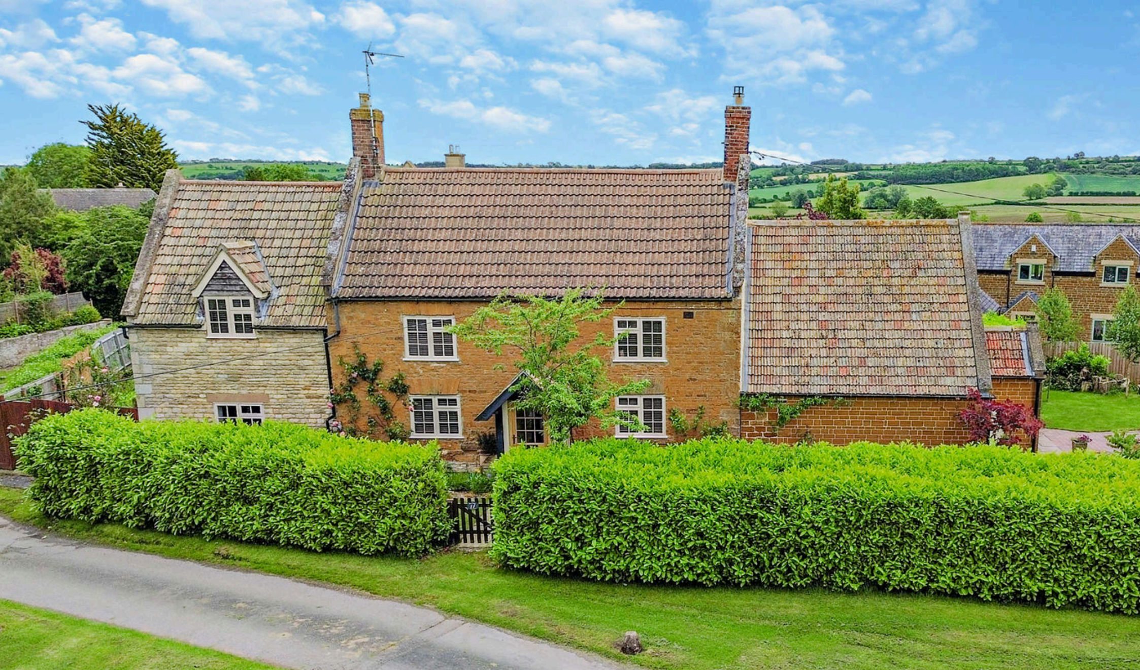
TUDOR COTTAGE THORPE BY WATER, RUTLAND