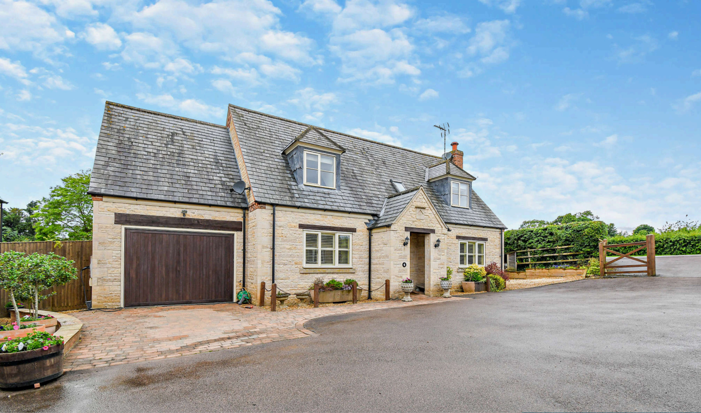
IVY HOUSE HEY COURT, BARROWDEN