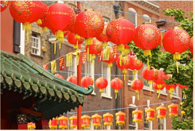
Rupert Court, Chinatown W1