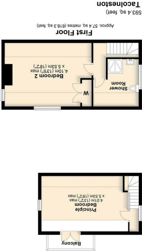
Elm View Cottage, The Green, Tacolneston