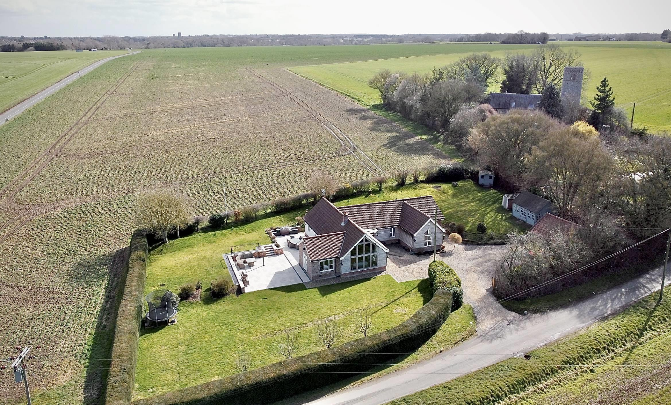
Church Cottage, Low Street, Crownthorpe, Wymondham, Norfolk NR18 9EU