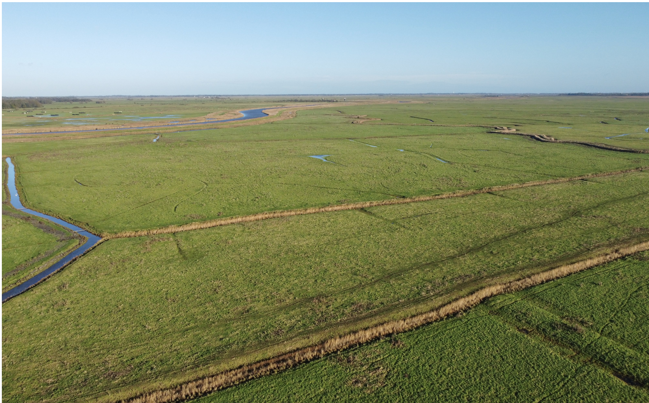
Grazing Marshes at Haddiscoe Island, Norfolk