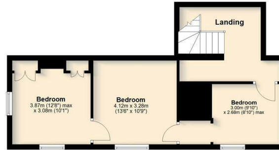
First Floor Approx. 41.1 sq. metres (442.3 sq. feet) Total area: approx. 127.5 sq. metres (1372.4 sq. feet)