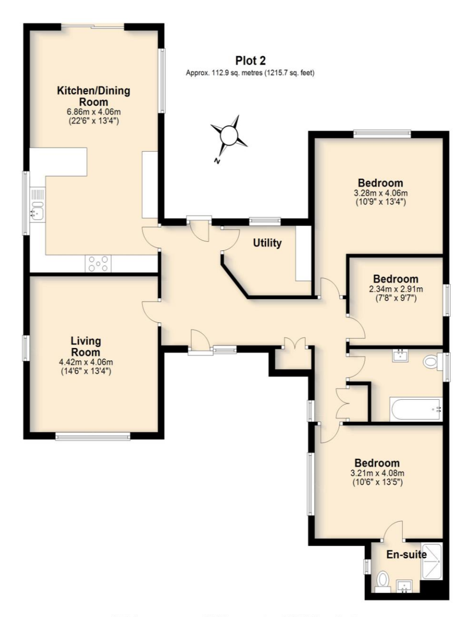
Total area: approx. 112.9 sq. metres (1215.7 sq. feet)