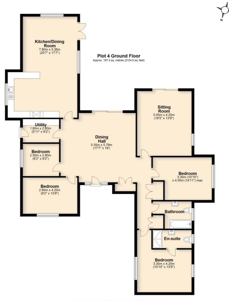
Total area: approx. 197.3 sq. metres (2124.0 sq. feet)