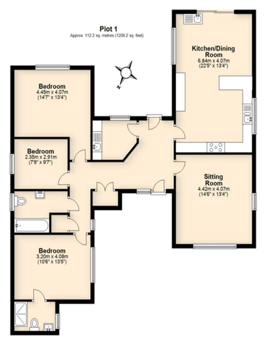
Total area: approx. 112.2 sq. metres (1208.2 sq. feet)