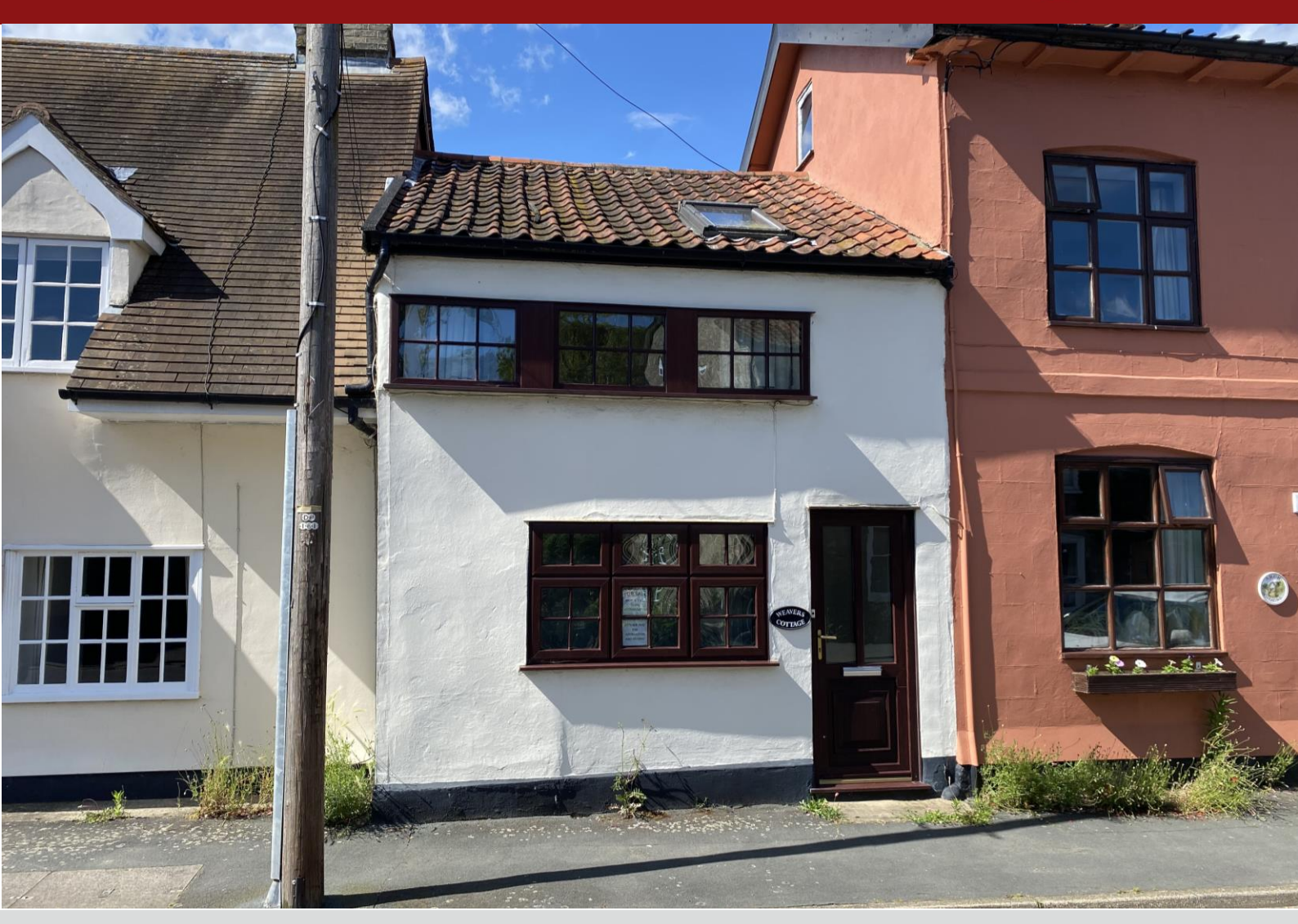
Weavers Cottage 22a Front Street Mendlesham Suffolk IP14 5RY