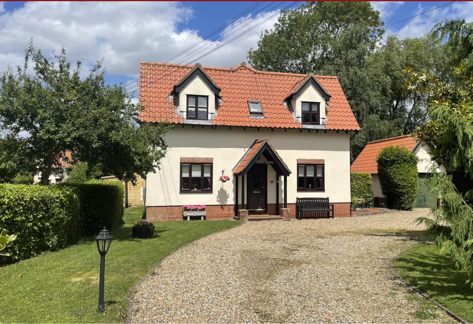
Cherry Tree Cottage Old Norwich Road, Yaxley Eye IP23 8BH