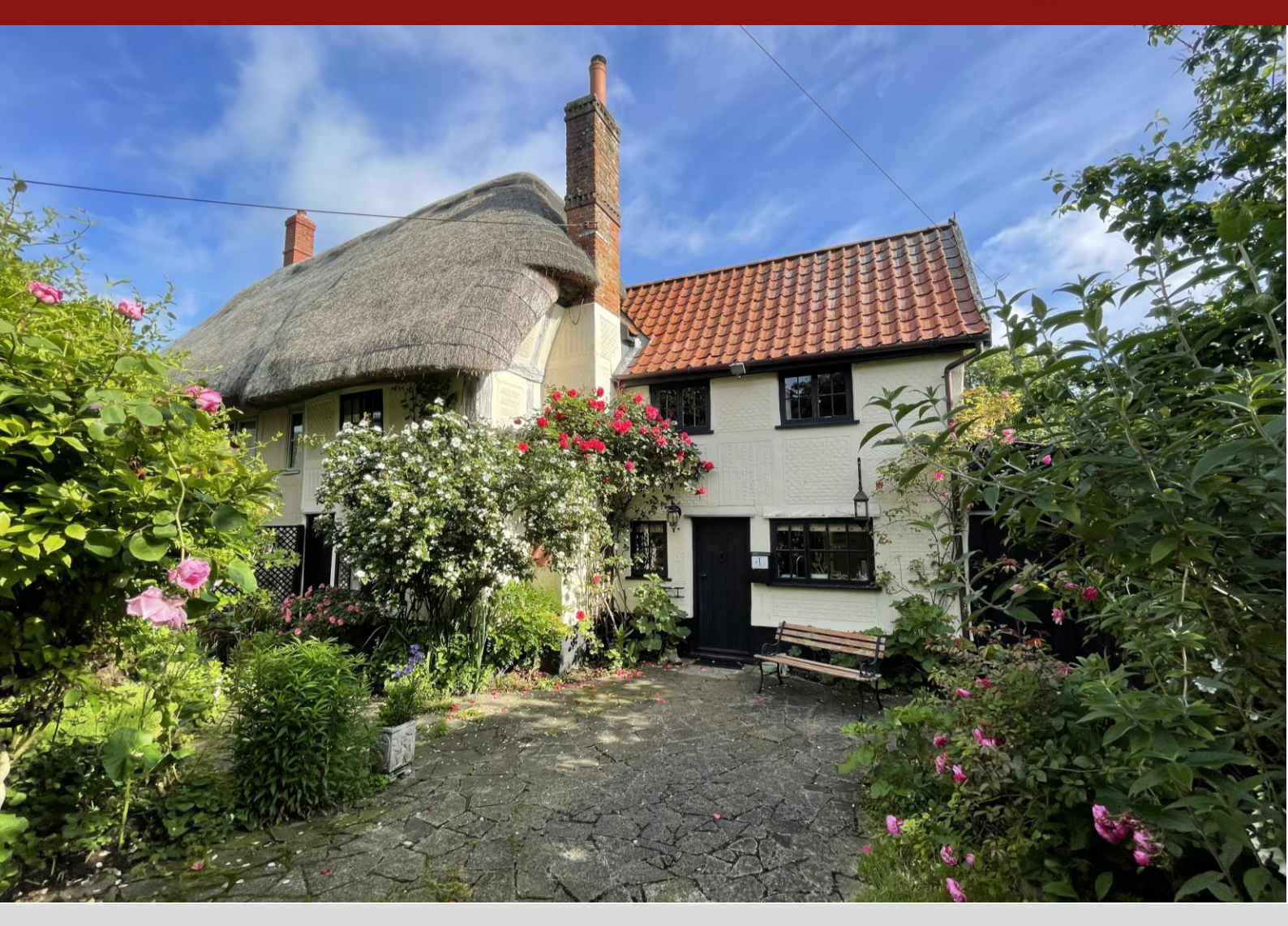
No.1, The Cottage Mendlesham Road Cotton Stowmarket IP144RB