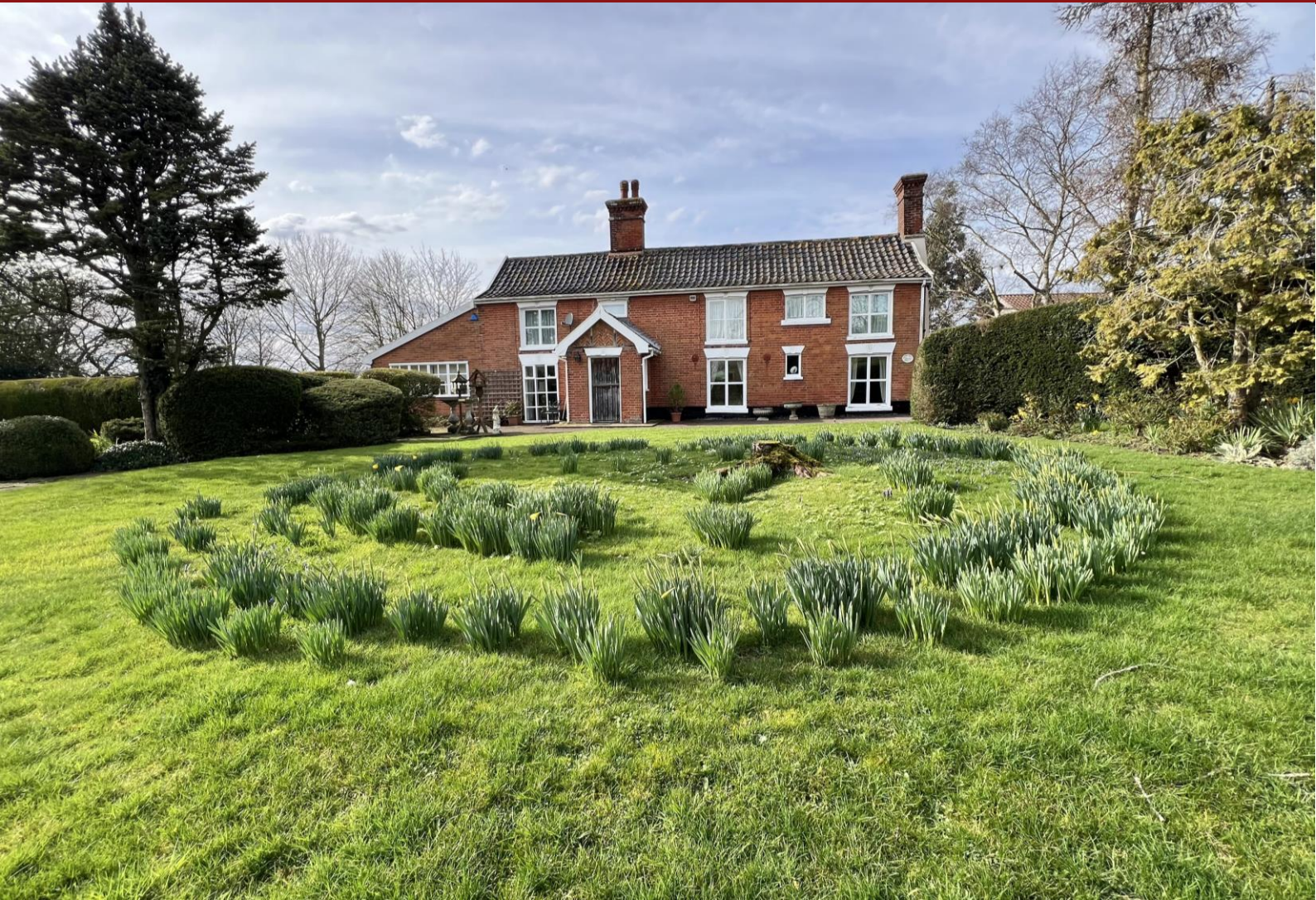
The Old Mill House Mill Green Burston IP22 5TJ