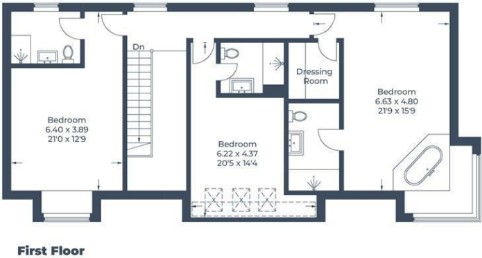
Illustration for identification purposes only, measurements are approximate, not to scale. © CJ Property Marketing Produced for Fine & Country