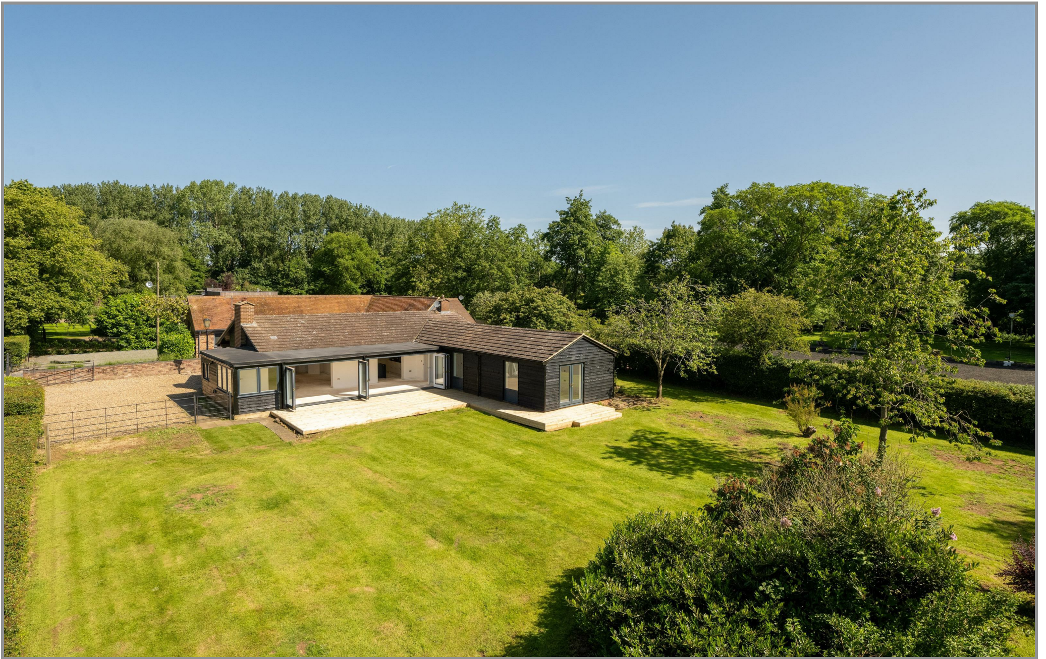
Lower Church Farm, Mursley, MK17 0RS