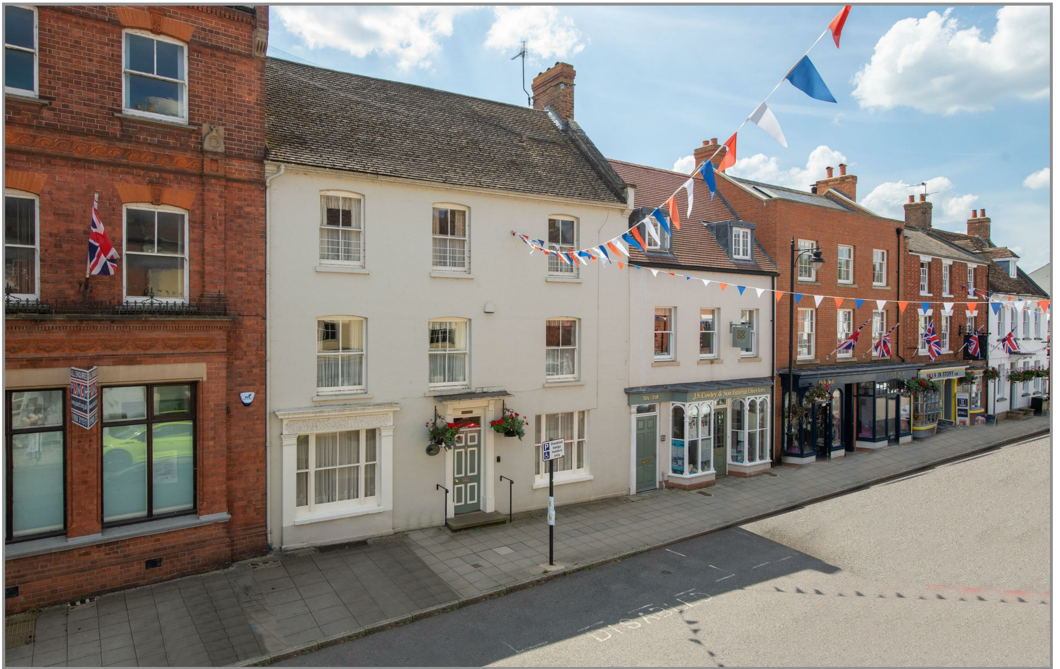
High Street, Stony Stratford, MK11 1AY