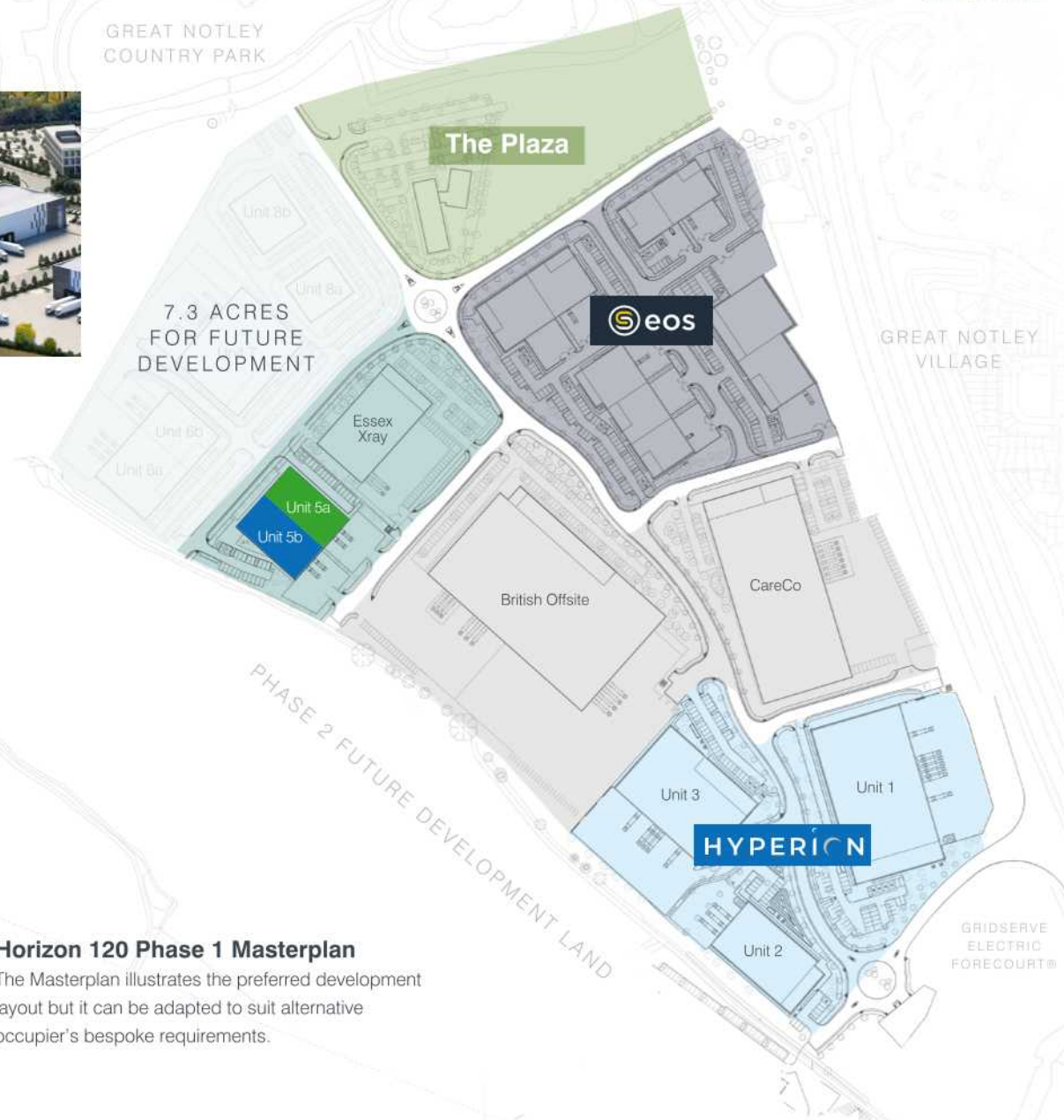
Horizon 120 Phase 1 Masterplan The Masterplan illustrates the preferred development layout but it can be adapted to suit alternative occupier's bespoke requirements.