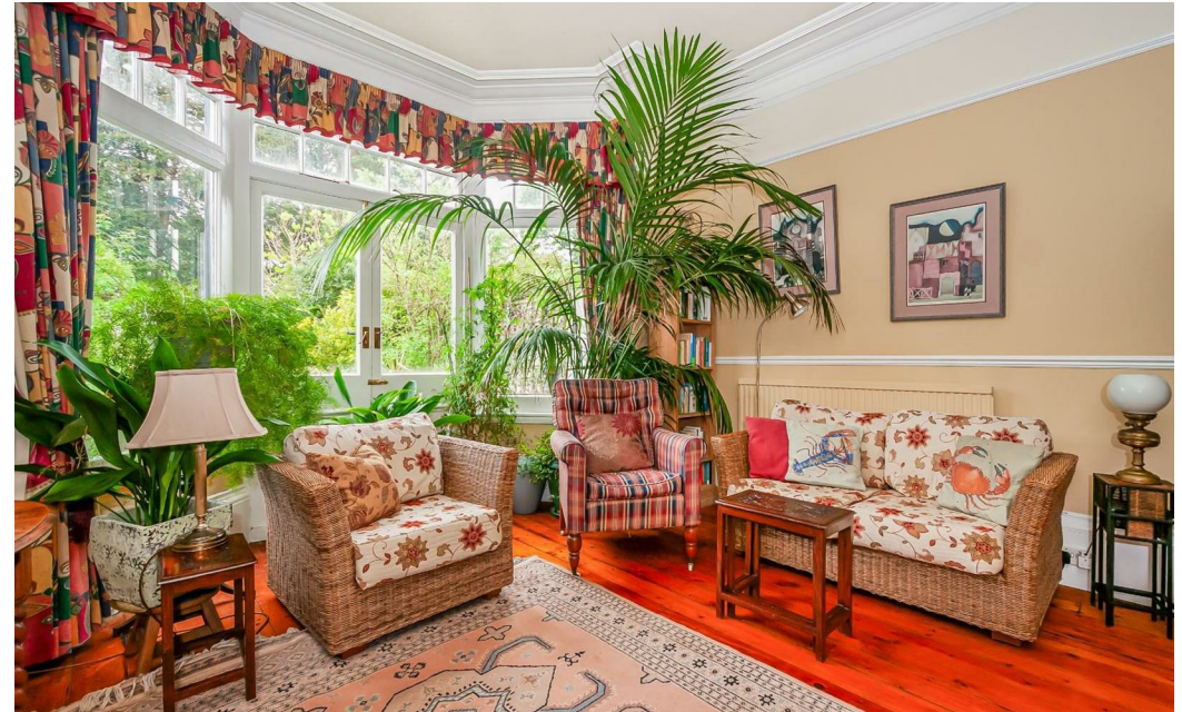
Council Tax Banding; G

Material Information - Hunters Beverley Tenure Type; Freehold