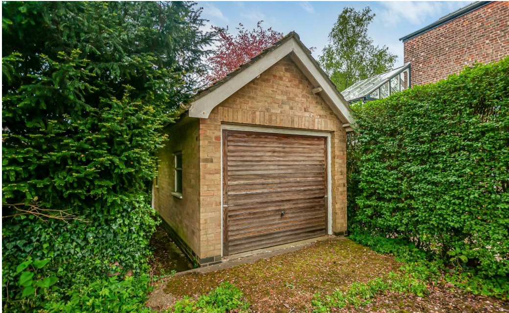
Parking On Street Permit Parking to the front aspect of the property.