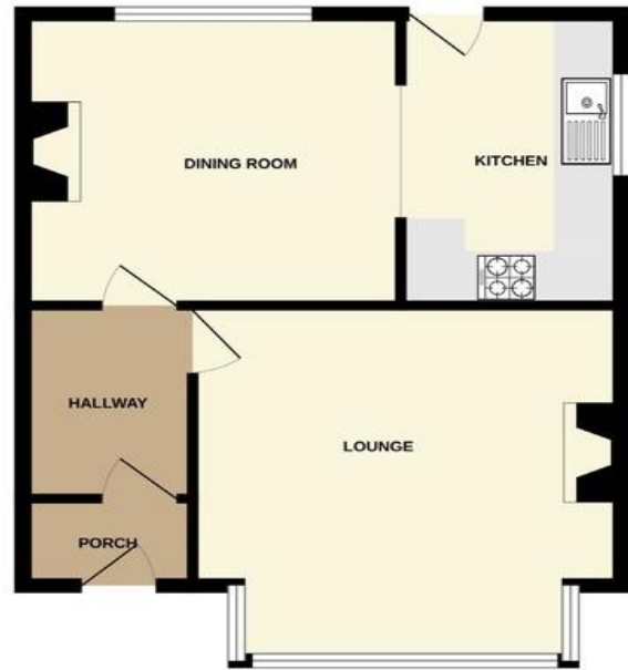
GROUND FLOOR 480 sq.ft. (44.6 sq.m.) approx.