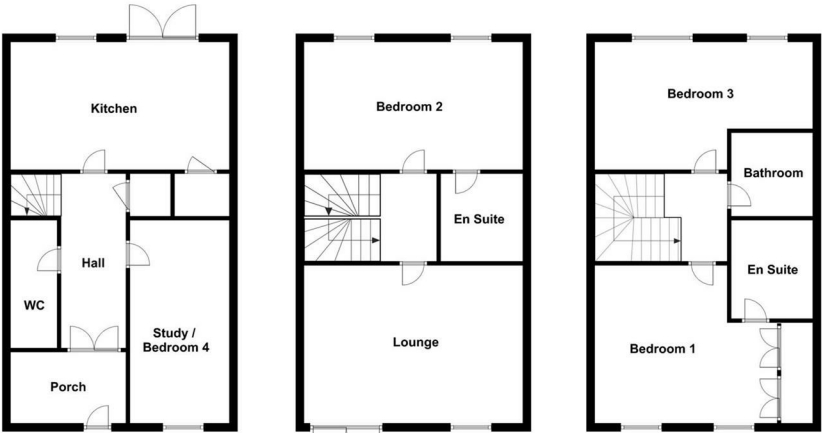
This floor plan is not to scale and is for illustrative purposes only. We make no guarantee, warranty or representation as to its accuracy and completeness.