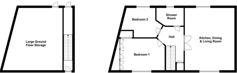
This floor plan is not to scale and is for illustrative purposes only. We make no guarantee, warranty or representation as to its accuracy and completeness.