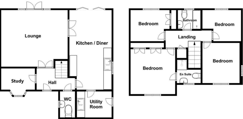
© Essex EPCs This floor plan is not to scale and is for illustrative purposes only. We make no guarantee, warranty or representation as to its accuracy and completeness.