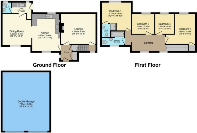
Garage Total floor area 167.3 sq.m. (1,801 sq.ft.) approx