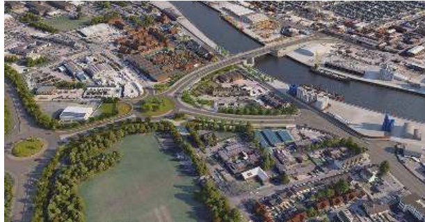
CGI of proposed third river crossing.