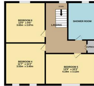
2ND FLOOR 643 sq.ft. (59.8 sq.m.) approx.