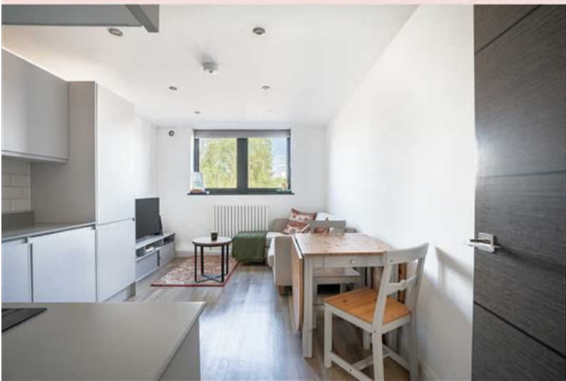
GROUND FLOOR 222 sq.ft. (20.6 sq.m.) approx.

APPROXIMATE FLOOR AREA 44.5 SQM / 480 SQFT