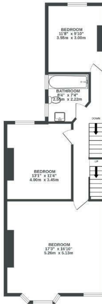
1ST FLOOR 675 sq.ft. (62.7 sq.m.) approx.