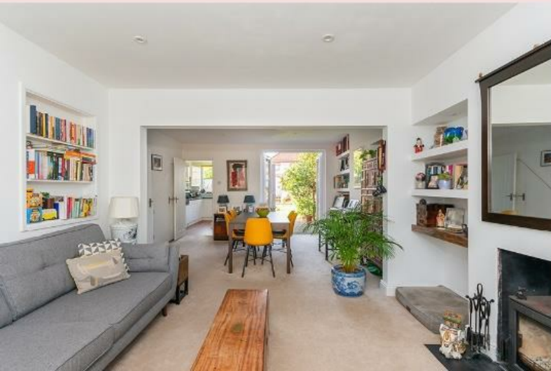
GROUND FLOOR 467 sq.ft. (43.4 sq.m.) approx.

APPROXIMATE FLOOR AREA 83.8 SQM / 902 SQFT