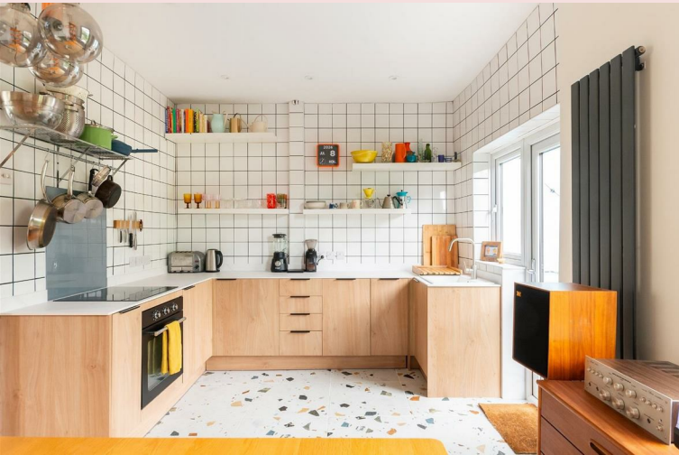
GROUND FLOOR 416 sq.ft. (38.7 sq.m.) approx.