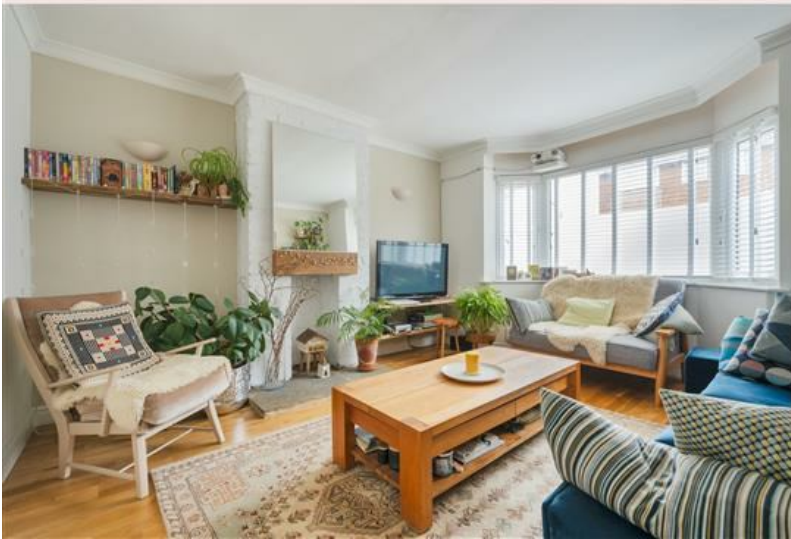
GROUND FLOOR 551 sq.ft. (51.2 sq.m.) approx.

APPROXIMATE FLOOR AREA 96 SQM / 1033 SQFT