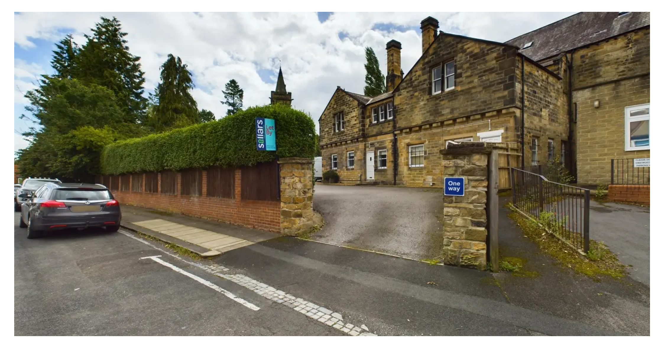
Tower House, Tower Road, Darlington Darlington