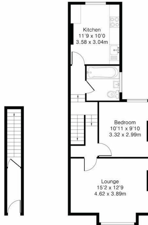
Ground Floor First Floor