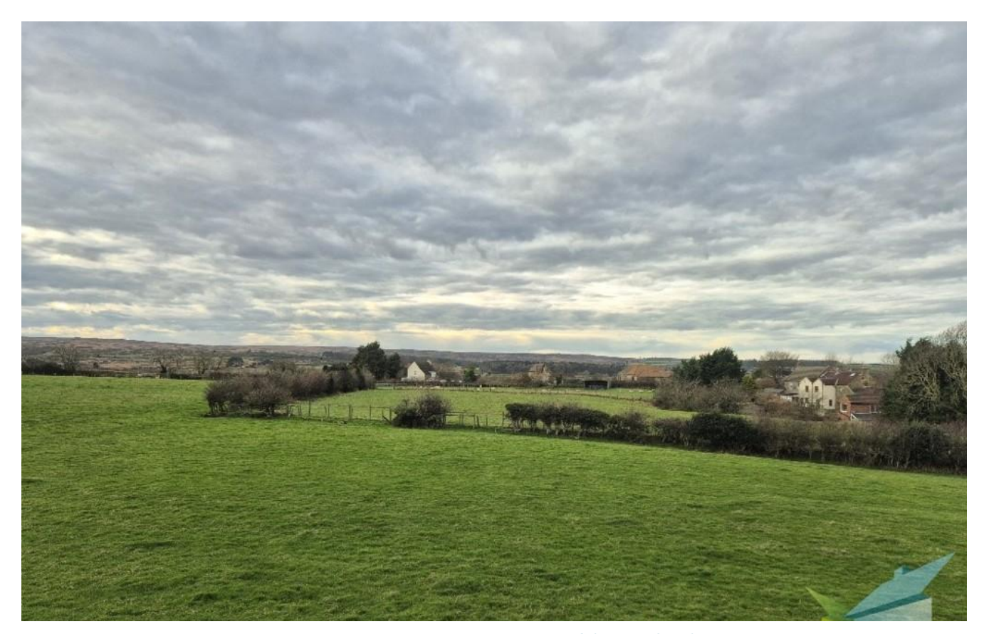
Ward Street, Moorsholm 3 Bedrooms, 1 Bathroom £185,000