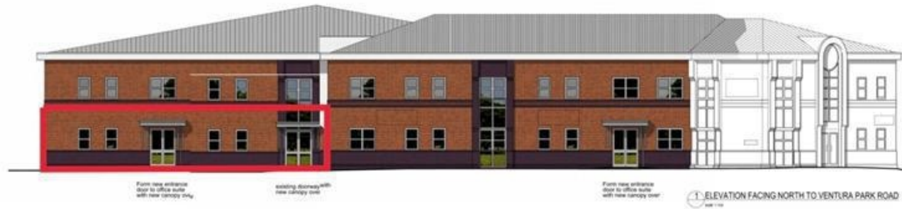
1 ELEVATION FACING NORTH TO VENTURA PARK ROAD see 1.10