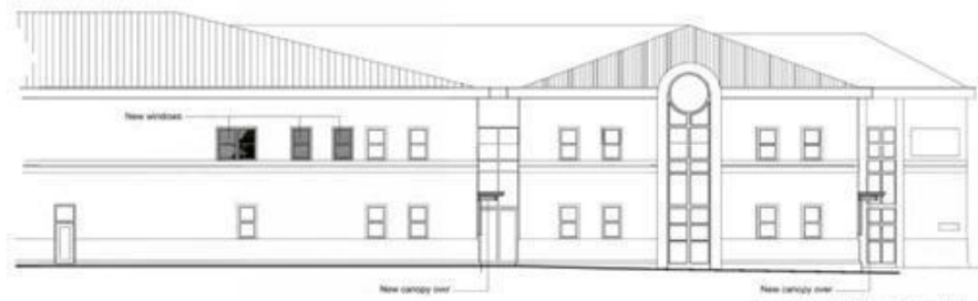
2 ELEVATION FACING EAST TO ALDI see 1.10