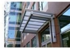
TYPICAL CANOPY VIEW see 1.11