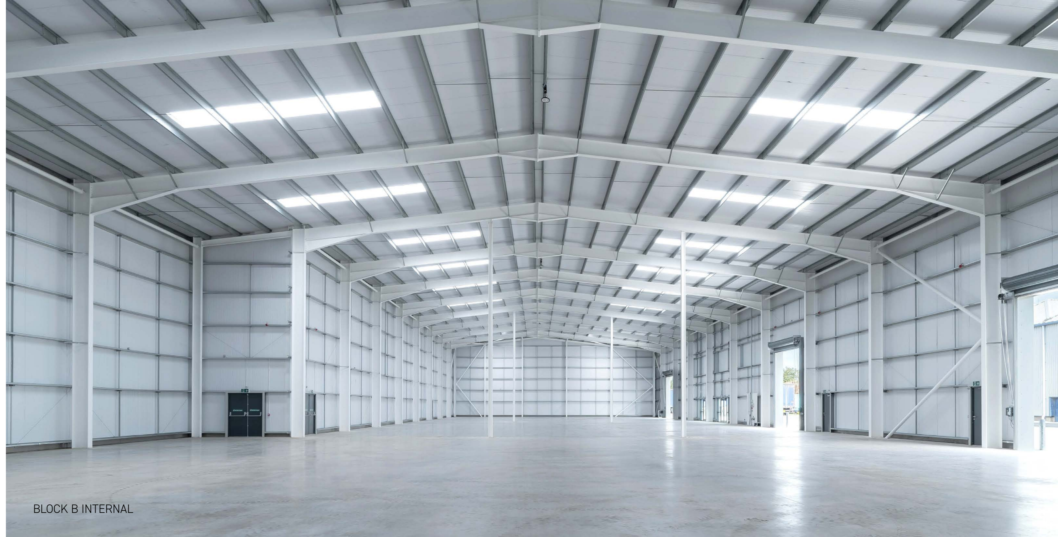
BLOCK B INTERNAL