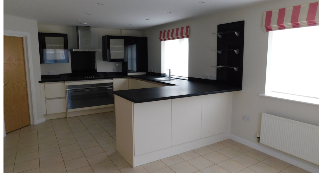
An extremely well presented four bedroom property with integral garage close to the Royal Shrewsbury Hospital with excellent schools and amenities close by.