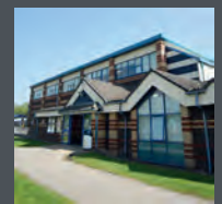
BIRCHWOOD LEISURE & TENNIS COMPLEX 3 mins walk