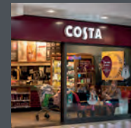
COSTA COFFEE + THE PLANET COFFEE HOUSE & GRILL 3 mins walk