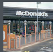
BIRCHWOOD SHOPPING CENTRE 2 mins walk