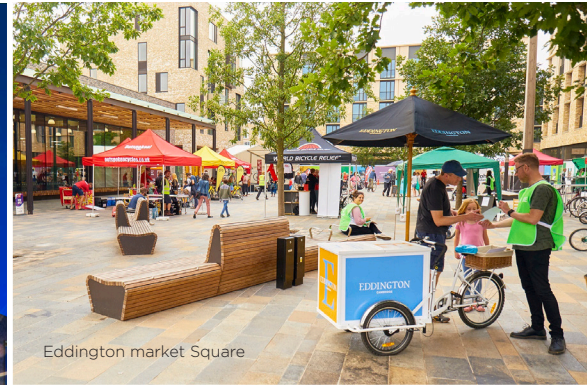
Eddington market Square