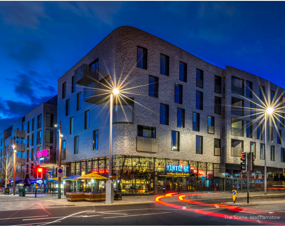
The Scene, Walthamstow