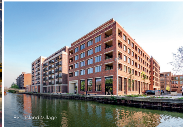
Fish Island Village

HILL IS ONE OF THE LEADING DEVELOPERS IN LONDON AND THE SOUTH EAST OF ENGLAND, DELIVERING DISTINCTIVE AND AWARD-WINNING NEW HOMES AND COMMUNITIES WITH THE COMMERCIAL SPACE AND AMENITIES THEY NEED TO THRIVE. WE ARE A 5 STAR HOUSEBUILDER, AND HAVE BEEN NAMED HOUSEBUILDER OF THE YEAR.