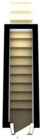
Ground Floor Approx. 3.0 sq. metres (32.7 sq. feet)