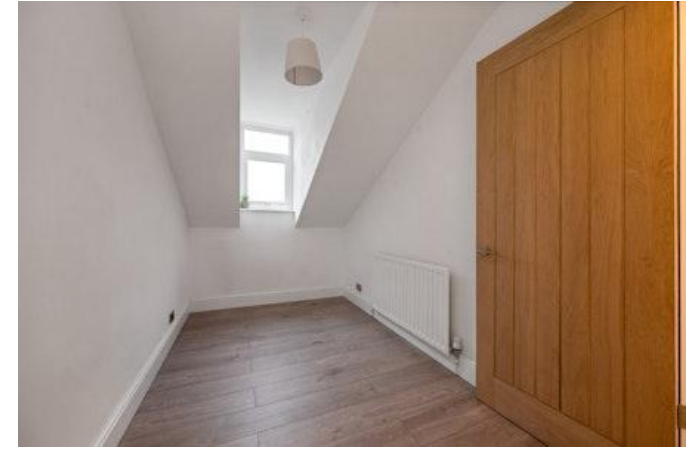
Bedroom One 4.04m x 3.34m (13'4" x 11'0")