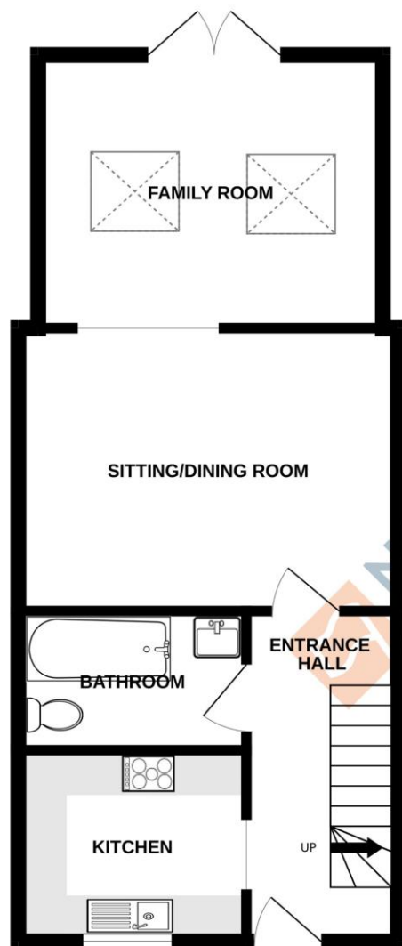
GROUND FLOOR 454 sq.ft. (42.2 sq.m.) approx.